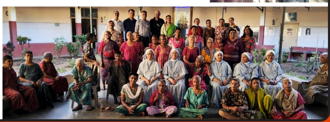
Parish Vision: That every parishioner works & grows towards a participative servant church in the Mission of Jesus